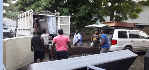
Helpers from Haiti Teen Challenge and Celebrate Recovery