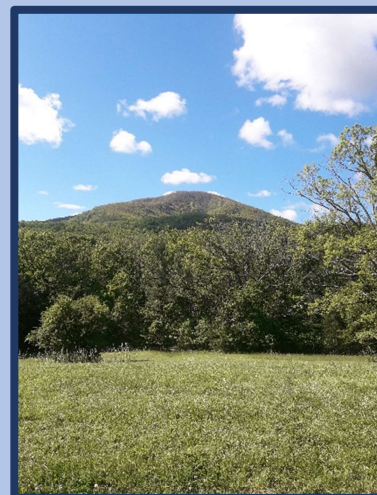
Blue Ridge Mountains