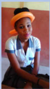
MIRLANDE AT A SCHOOL PARTY