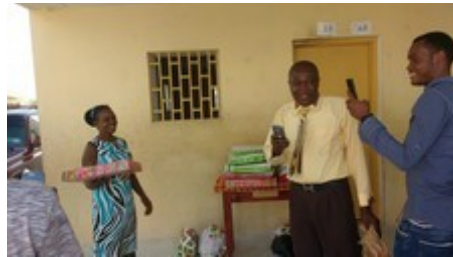
Christmas Day party at Loving Hands Orphanage